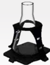
Rubber holder for flask