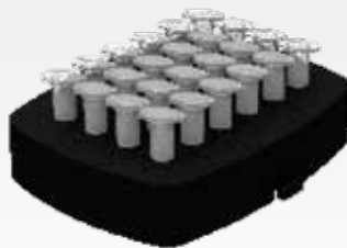
Foam for micro tubes