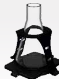
Rubber holder for flask